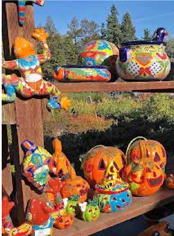
POTTERY DISPLAY AT CENTRAL WHOLESALE NURSERY, SAN JOSE

To join, you must be a SCVWS member and have attended a Thursday Paintsite event. For details on joining the Paintsites FB Private Group and upcoming Paintsites, go here .