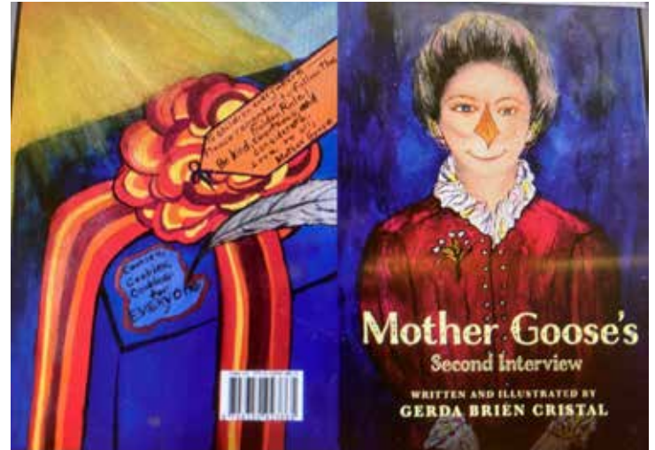
FRONT AND BACK COVERS