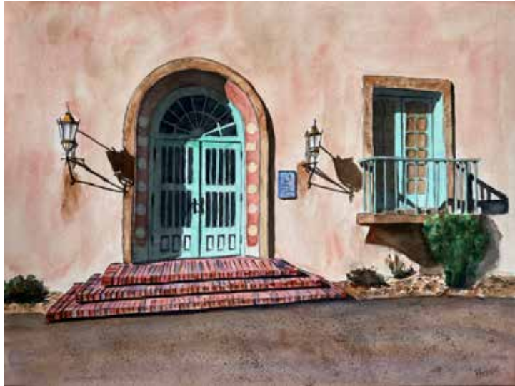
"MORNING SHADOWS" BY PATTI PIERCE

Patti Pierce's watercolor painting "Morning Shadows" was accepted into the California Watercolor Society's Show "Color-Subtle or Wild" and will be exhibited at City of San Ramon City Hall Gallery from November 1-December 22, 2023.