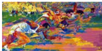
"Olympic Track" (1976) LeRoy Neiman (1921-2012)

LeRoy Neiman (born LeRoy Leslie Runquist) was an American artist known for his brilliantly colored, expressionist paintings and screenprints of athletes, musicians, and sporting events. read more