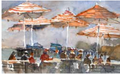
"HAPPY HOUR" BY TANVI BUCH

as well as a folder of art supplies, and a complimentary lunch at Paradise Beach Grille. The pièce de résistance was a beautiful outdoor reception for the artists at the gorgeous Shadowcreek Restaurant overlooking Soquel Creek and the Trestle Bridge. As a painting 'grand finale,' the Quick Draw event on the penultimate day added to the challenge and the pressure of painting and framing in 2 hours and being back at the panels for judging.