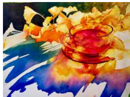
WATERCOLOR BY SARAH BEEKLEY