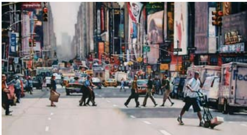
"BUSY IN NYC" BY KAREN FREY WATERCOLOR 26 X 48.