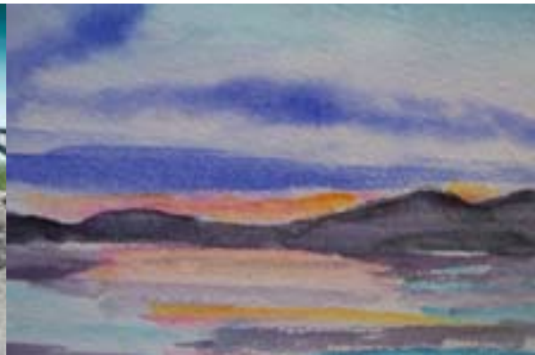
SKETCH DONE OF SUNSET ON LONG LAKE, NY, IN THE ADIRONDACK MOUNTAINS, WHERE A FAMILY QUICKLY ADOPTED US, TRANSPORTED US TO THEIR STONE COTTAGE FOR DINNER, AND GAVE US A BOATRIDE ON THE LAKE AT SUNSET. THE PERSONAL KINDNESSES ABOUNDED ACROSS THE US, AND WE ARRIVED AT OUR DESTINATION WITH RENEWED FAITH IN THE AMERICAN PEOPLE.