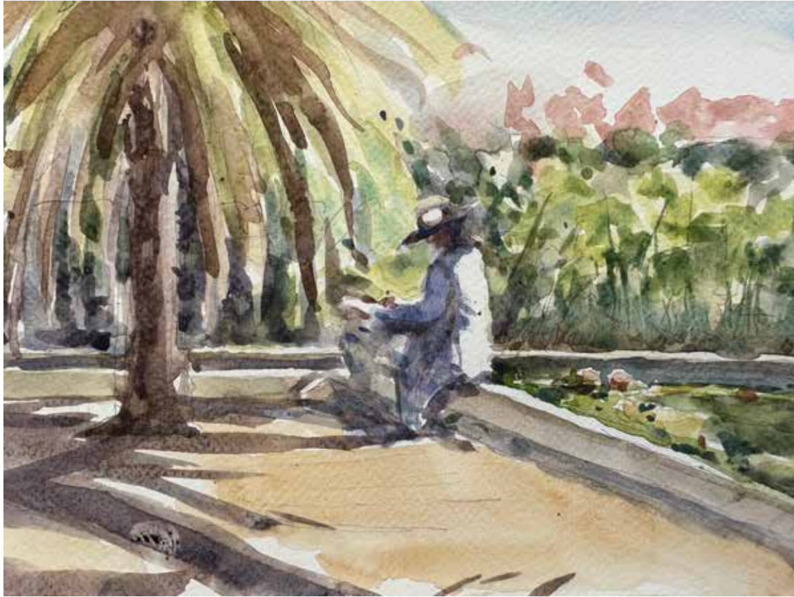
"Tanvi painting at Rosicrucian Museum Gardens"