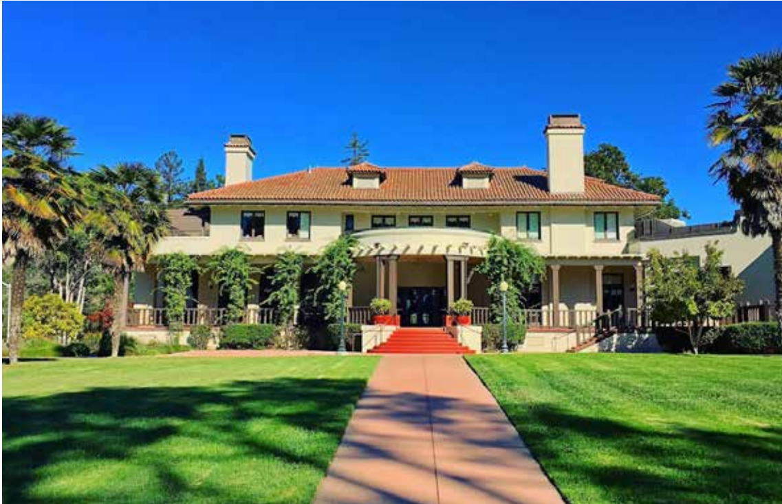
SESNON HOUSE