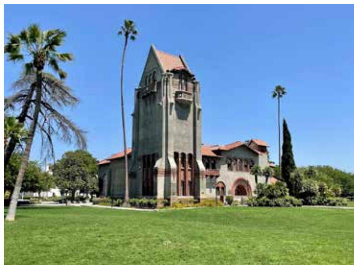
SJSU TOWER HALL