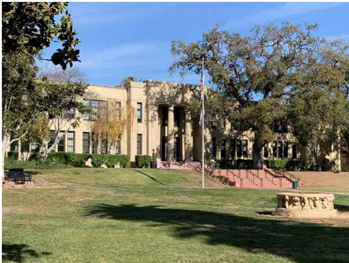
LOS GATOS HIGH BY ALISON TURNER